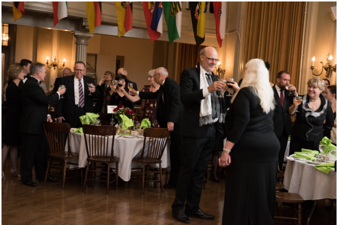
Guests raise a glass to the 253rd anniversary of the German Society at our annual Stiftungsfest, November 4, 2017